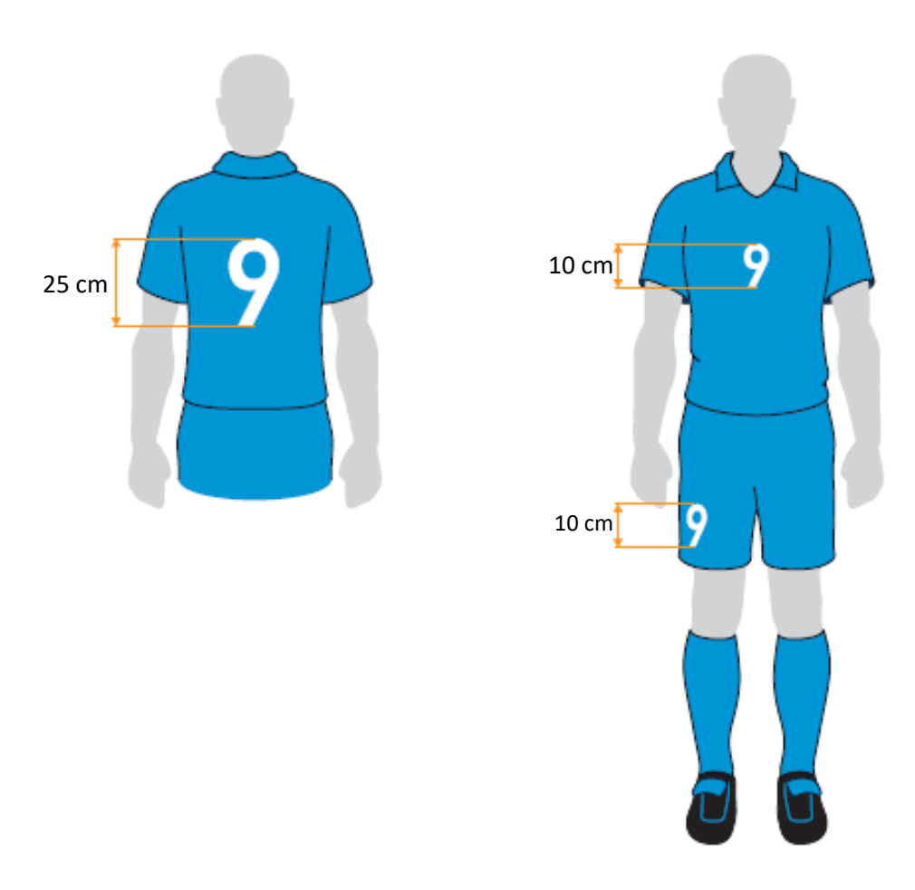
Appendix 4 Player's Name/Surname